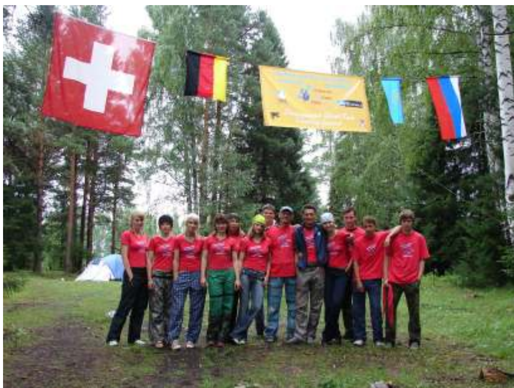
Mass media support

45 sportsmen took part in the Festival 2006. Among them: 2 girls from Switzerland, 1 girl from Germany, 1 boy from Kazakhstan, and others from Russia. All the participants got the souvenirs with the symbols of the capital of the Urals, special t-shirts with the symbols of YC UIAA, Global Youth Summit 2006.