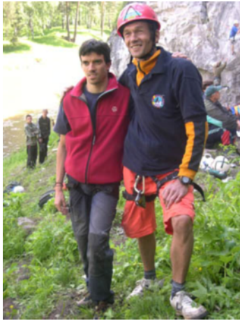
Some Festival and seminar images