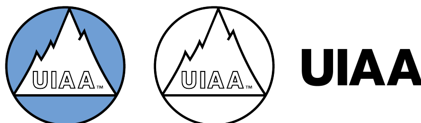
Figure 2: UIAA Trademark or the four letters "UIAA" word mark.

For any model of mountaineering equipment, which has been granted the UIAA Safety Label, the UIAA Trade-mark (see Figure 2) or the four letters "UIAA" shall be marked clearly and indelibly on each item sold in accordance with the branding guidelines specified in the "Regulations for existing and potential Safety Label Holders".